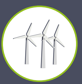
FOSSIL FUELS & RENEWABLE ENERGY