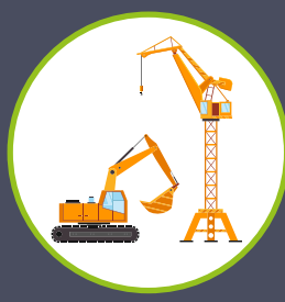
CONSTRUCTION & INFRASTRUCTURES