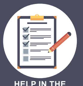
HELP IN THE REALIZATION OF SPECIFICATIONS